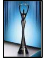
Electra Award 2005