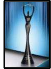
Electra Award 2005