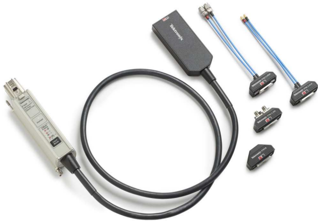
P7630 Low Noise TriMode Probe