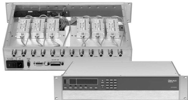
Multi-Channel 19" Rack Size Versions

Most 8310 Series are single channel configurations where RF signal is routed through either the front or rear mounted Ports A & B but can be configured for up to four channels of attenuation, RF switching, amplification or other functions. Multiple programmable attenuators can be used in conjunction with other coaxial devices such as switches, power combiners, directional couplers, and filters creating single or multichannel subsystems.