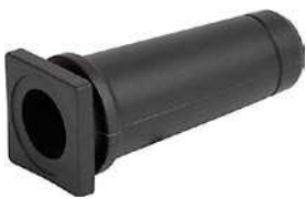
4311.9309 PVC Strain Relief for rewirable connectors