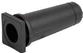
4311.9324 PVC Strain Relief for rewirable connectors