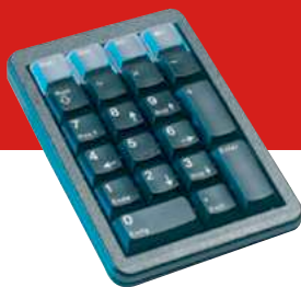
G84-4700 PRB (1)