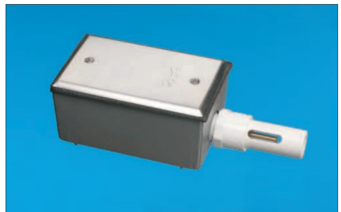
Outdoor Air Sensor with Weatherproof Box