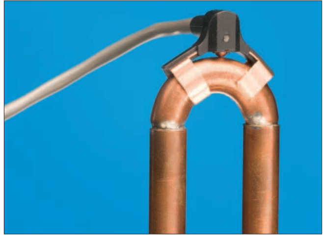
Sens-A-Coil Thermistor Sensor

This patented (Patent #6,814,486 B2) design from SS&C is the solution for sensing condenser and evaporator return bend temperatures. The Sens-A-Coil comes standard with 10ft. of AWG#22 PVC jacketed cable. Please contact the factory for specific design or application information or the availability of options.