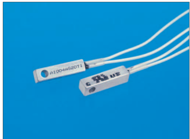
UL Listed Surface Temperature Sensor

SS&C assembly A1004AS20T1 is a general purpose thermistor probe for temperature sensing and is listed with Underwriters Laboratories (Certification file E193945). This sensor can be used to monitor air temperature or can be screw mounted for surface temperature measurement. The assembly consists of a highly stable NTC thermistor that is epoxied into an aluminum housing. The thermistor is a 10k\Omega thermistor with an accuracy of \pm 0.2^\circ\text{C} from 0^\circ\text{C} to 70^\circ\text{C} . The sensor leads are AWG#20, teflon insulated UL rated wire. Sleeving is used to provide strain relief and to guarantee the UL rated 400 volt isolation between the sensor and the housing. The assembly is UL rated for operation to 105^\circ\text{C} .