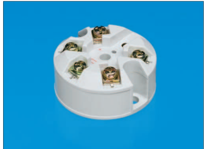
Push Button Temperature Transmitter

A complete data sheet with input and output specifications is available by contacting SS&C Engineering.