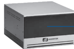
▲ Rear view