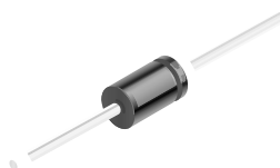
DO-35 Glass case COLOR BAND DENOTES CATHODE