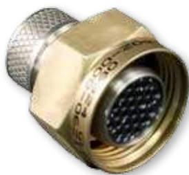
Series 802 Plug

Glenair's Series 802 Mighty Mouse connectors feature stainless steel or marine bronze shells with marine bronze coupling nuts to withstand corrosion in the most hostile environments, and are designed to accommodate (depending on insert arrangement) Glenair size #16, #20HD, or #23 fiber optic termini (termini sold separately.) Metal clips inside the connector body lock the termini into place. Termini are removable. Rated for 3500 PSI when mated, these connectors are suitable for the most demanding geophysical and underwater applications. Terminate cable shield directly to integral shield attachment platform with BAND-IT strap, or choose rear accessory thread to attach optional backshell. Available in shell sizes 1 through 21 in 30 insert arrangements.