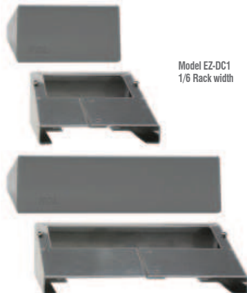
Model EZ-DC1 1/6 Rack width