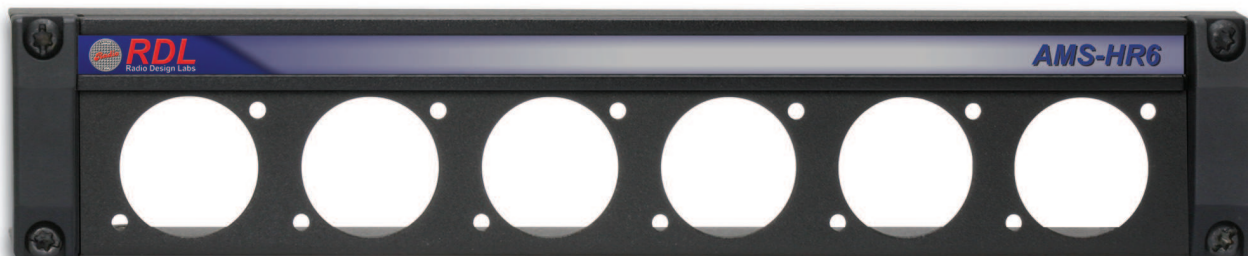
AMS-HR6 AMS Mounting Panel