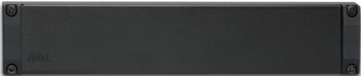
HR-FP1 Filler Panel