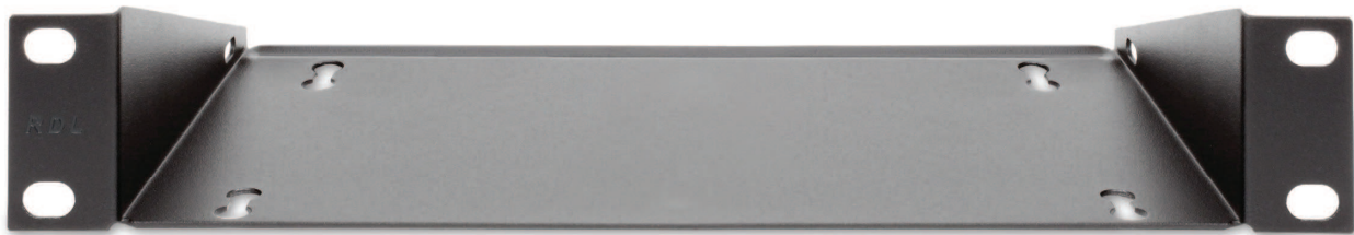
HR-HRA1 10.4" Rack Adapter