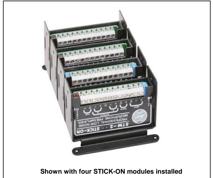
Shown with four STICK-ON modules installed

APPLICATION: The ST-PBR4 is a mounting frame with slots for four STICK-ON modules. The ST-PBR4 mounts on an FP-PSB1A power supply bracket, to any flat surface or in an FP-RRA or FP-RRAH rack panel. The ST-PBR4 design allows the installer to secure the modules without using any adhesive pads. Each module slides in and snaps into position. It may be easily released for adjustment or removal.