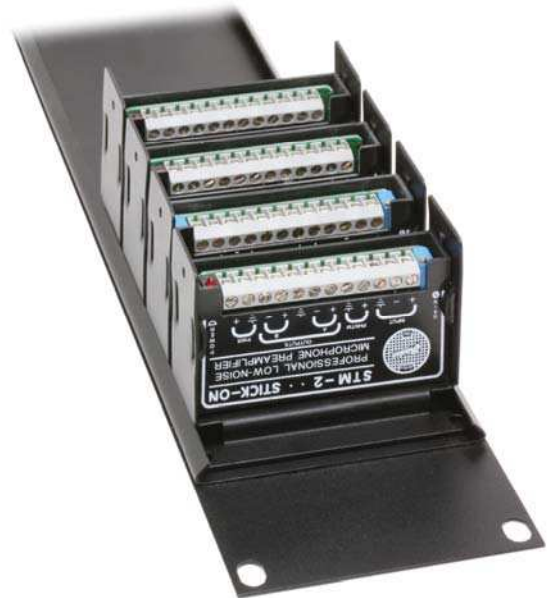
ST-PBR4 mounted in an FP-RRA rack mount panel.

The FP-PSB1A/ST-PBR4 assembly may be mounted directly to any flat Surface or may be mounted in an RDL FP-RRA or FP-RRAH rack panel.