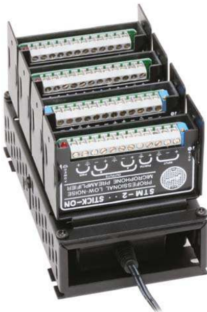
ST-PBR4 mounted on FP-PSB1A power supply bracket.

The FP-PSB1A/ST-PBR4 assembly may be mounted directly to any flat Surface or may be mounted in an RDL FP-RRA or FP-RRAH rack panel.