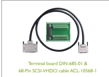
Terminal board DIN-68S-01 & 68-Pin SCSI-VHDCI cable ACL-10568-I