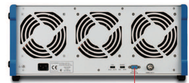
Remote Monitoring Port