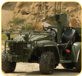
Navigation and Control