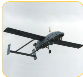
UAV Flight Control

The AHRS440 combines highly reliable MEMS sensors (gyros and accelerometers) with low noise magnetometers to provide accurate attitude and heading in a small and rugged environmentally-sealed enclosure. The AHRS440 provides consistent performance in challenging operating environments and is user-configurable for a wide variety of applications.