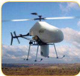
UAV Flight Control