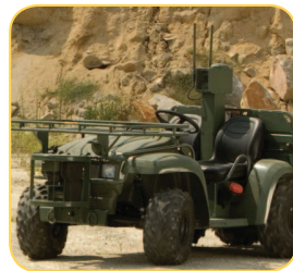
Land Vehicle Guidance

The NAV440 combines highly reliable MEMS sensors, magnetometers, and a WAAS/EGNOS-enabled GPS receiver all in a small and rugged environmentally sealed enclosure. The NAV440 provides consistent performance in challenging operating environments, and is user-configurable for a wide variety of applications.