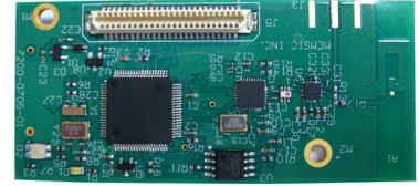
Lotus Mote (bottom view)

The Lotus is factory configured to run the RTOS. Several other operating systems are available for Lotus including Mot-eRunner and TinyOS. Additional system software is available from Open Source. For the latest operating systems and additional third party accessories please visit www.memsic.com