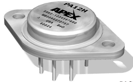
8-PIN TO-3 PACKAGE STYLE CE