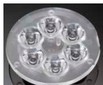
ANNA-6 D= 50 MM (6UP) PMMA

SHARP DOUBLE DOME C11612_ANNA-50-5-S C11613_ANNA-50-5-M C11614_ANNA-50-5-W