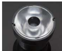
IRIS D= 38 MM PMMA

PHILIPS LUMILEDS LUXEON REBEL ES C12353_LOTTA-A2 CA12396_LOTTA-A2