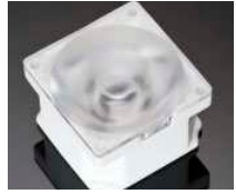
ROSE 21.6 MM X 21.6 MM PC (*COP)

FA10668_CXP-RS FA10667_CXP-SS FA10666_CXP-D FA10665_CXP-M FA10669_CXP-O FA11153_CXP-O-90 FA10708_CXP-W