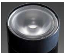
EVA D= 37.7 MM PMMA