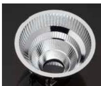
TYRA (TYCO) D= 40 MM METALLIZED PC

PHILIPS LUMILEDS LUXEON M CA12881_MINNIE-M CA12882_MINNIE-W CA12883_MINNIE-WWWW