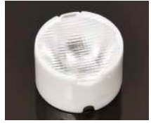
TINA D= 16.1 MM PMMA

CREE XP-E / XP-G FA10887_TINA-RS FA10644_TINA-D FA10645_TINA-M FA11200_TINA-O FA10838_TINA-W FA11019_TINA-WW