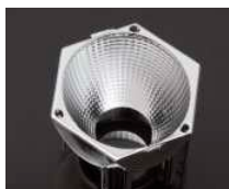
BOOMERANG D= 22.2 MM METALLIZED ABS