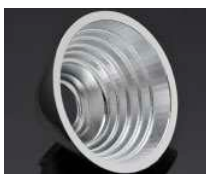
TYRA3 D= 40 MM METALLIZED PC

CREE MP-L CA11475_TYRA2-S CA11476_TYRA2-M CA11477_TYRA2-W