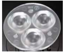
MARTHA / TUIJA D= 50 MM (3UP) PMMA

SHARP DOUBLE DOME C11606_ANNA-50-3-S C11607_ANNA-50-3-M C11608_ANNA-50-3-W