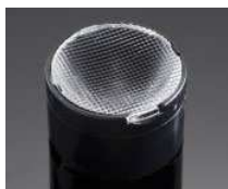
LEILA D= 21.6 MM PMMA