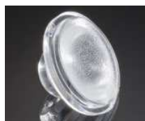
EVA D= 35 MM PMMA

CA12806_EVA-S CA12802_EVA-D CA12803_EVA-M CA12804_EVA-W CA12805_EVA-WW