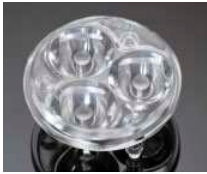
SATU D= 21.8 MM (3UP) PMMA

CREE XP-E / XP-G C11916_SATU-S C11917_SATU-O C11602_SATU-M C11544_SATU-W