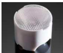
LEILA D= 21.6 MM PMMA