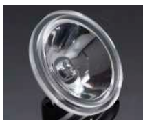
CRYSTAL MM X MM PMMA

PHILIPS LUMILEDS LUXEON REBEL / REBEL ES C12446_SOPHIE