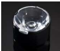
TINA2 D= 16.1 MM PMMA

CP12682_TINA2-RS CP12683_TINA2-D CP12684_TINA2-O CP12685_TINA2-M CP12686_TINA2-W