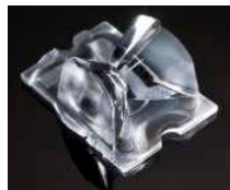
STRADA-T-DW 15.5MM X 19.6 MM PMMA

SEOUL Z5 C11425_STRADA-T-DW CA11426_STRADA-T-DW