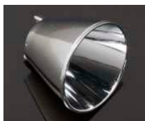
REGINA D= 19 MM METALLIZED PC