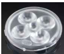
PENTA D= 35 MM (5UP) PMMA

PHILIPS LUMILEDS LUXEON A C12771_RER-7-S