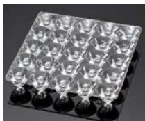
VIRPI D= 75MM X 75MM PMMA

CREE XP-G / XT-E / XB-D C12607_VIRPI-S C12608_VIRPI-M C12609_VIRPI-W