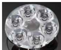
ANNA-6 D= 40 MM (6UP) PMMA

SHARP DOUBLE DOME C11713_ANNA-40-5-S C11714_ANNA-40-5-M C11715_ANNA-40-5-W