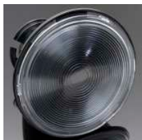
LENA D= 111 MM METALLIZED PC

CN12293_LENINA-S CN12296_LENINA-S-DL CN12294_LENINA-M CN12297_LENINA-M-DL CN12295_LENINA-W CN12298_LENINA-W-DL