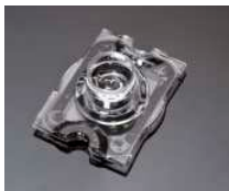
STRADA-S 15.5MM X 19.6 MM PMMA

CREE XP-E / XP-G CA11248_STRADA-S C11249_STRADA-S