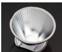
TYRA2 D= 40 MM METALLIZED PC

CREE MP-L C11394_TYRA-S C11395_TYRA-M C11396_TYRA-W