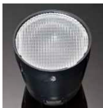
RGBX D= 30 MM PMMA

NICHIA NCS19 / NVS19 F11947_JULIA-A FA11948_JULIA-A