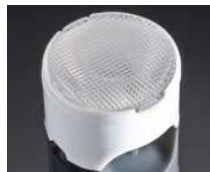
LEILA D= 21.6 MM PMMA

FA10696_LN2-RS FA10695_LN2-D FA10697_LN2-M FA11452_LN2-M2 FA11108_LN2-O-90 FA10698_LN2-REC