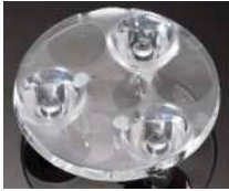
ANNA-3 D= 40 MM (3UP) PMMA

CREE XP-E / XP-G C11710_ANNA-40-3-S C11711_ANNA-40-3-M C11712_ANNA-40-3-W