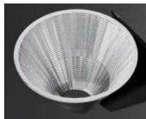
BARBARA D= 70 MM METALLIZED PC

PHILIPS LUMILEDS LUXEON S C11773_VENLA-S C11775_VENLA-M C11776_VENLA-W C11777_VENLA-WW