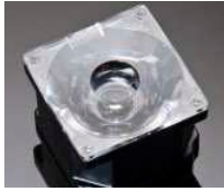
ROSE 21.6 MM X 21.6 MM PC