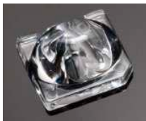
OONA-A 25MM X 25MM PMMA

SHARP DOUBLE DOME CA11998_EMILY-SS-WAS CA12000_EMILY-O-WAS