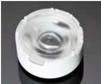
TINA3 D= 16.1 MM PMMA

SEOUL Z5 CP11627_LISA-RS CP10641_LISA-SS