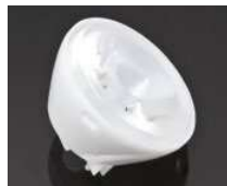
VENLA-IRIS D= 45 MM PC

SEOUL Z5 FCN12076_IRIS-SCREW FCA12077_IRIS