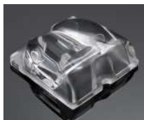
STRADA-SQ-A-T 25 MM X 25 MM PMMA

CREE MX6 / MX3 C12226_STRADA-FW CA12238_STRADA-FW