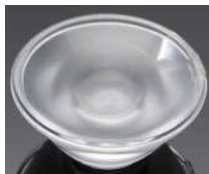
MIRA D= 32.4 MM PC