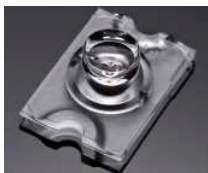
STRADA-S-14 13.9 MM X 19.6 MM PMMA

SEOUL Z5 CA11248_STRADA-S C11249_STRADA-S