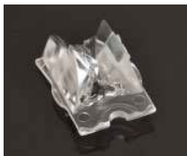
STRADA-T-DW 15.5 MM X 19.6 MM PMMA

OSRAM PLATINUM/DRAGON+ C10758_STRADA-A CA10820_STRADA-A