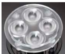
GT4 D= 35 MM (4UP) PMMA

CREE XP-E / XP-G C10921_GT4-S C10922_GT4-M C10923_GT4-W C10975_GT4-WW