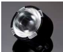
LISA2-CLIP D= 9.9 MM PMMA

FP11055_LISA2-RS-PIN FP10995_LISA2-M-PIN FP11125_LISA2-O-PIN FP11851_LISA2-O-90-PIN FP10996_LISA2-W-PIN FP10997_LISA2-WW-PIN FP11429_LISA2-WWW-PIN