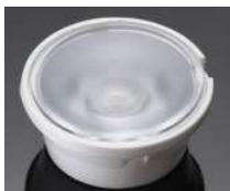
MIRA (with holder) D= 35 MM PC

C12500_MIRA-M C12501_MIRA-W C12502_MIRA-WW