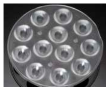
SANDRA D= 70 MM (12UP) PMMA

SHARP DOUBLE DOME C12285_ANGIE-S C12286_ANGIE-M C12287_ANGIE-M2 C12288_ANGIE-W