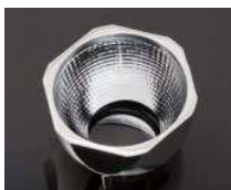
BRIDGET / LILY / CINDY D= 22.2 MM METALLIZED PC

BRIDGELUX LS-SERIES C10918_BRIDGET-S C10919_BRIDGET-M C10920_BRIDGET-W