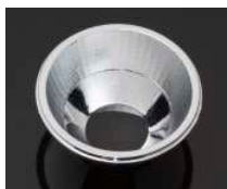
MINNIE D= 32.4 MM METALLIZED PC

CREE MT-G C12095_MINNIE-M C11862_MINNIE-W C12097_MINNIE-WWWW