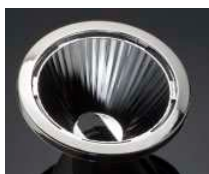
MIRELLA D= 50 MM METALLIZED PC

BRIDGELUX RS-SERIES CA11401_BRITNEY-M CA11402_BRITNEY-W