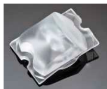
STRADA-FT 15.5 MM X 19.6 MM PMMA

CREE MX6 / MX3 C12331_STRADA-T-DW CA12333_STRADA-T-DW