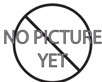
MELODY 50,6 MM PMMA

CREE MX6 / MX3 C10385_NIS83-MX-4-SS C10386_NIS83-MX-4-M C10387_NIS83-MX-4-W