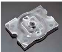
LOTTA-A 15.4 MM X 19.6 MM PMMA

SHARP DOUBLE DOME C10946_FLARE-B CA10932_FLARE-B