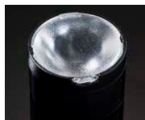
LEILA D= 21.6 MM PMMA

LUXEON REBEL ES CA11929_LR2-RS CA11930_LR2-D CA11931_LR2-M CA12629_LR2-O-90 CA12394_LR2-W