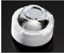
TINA3 D= 16.1 MM PMMA

PHILIPS LUMILEDS LUXEON REBEL FA11905_TINA3-S FA11870_TINA3-OO FA11824_TINA3-W FA11825_TINA3-WW FA11826_TINA3-WWW