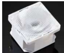
LAURA 21.6 MM X 21.6 MM PMMA

SHARP DOUBLE DOME CA11959_LAURA-RS-PIN CA12011_LAURA-SS-PIN CA11960_LAURA-D-PIN CA11837_LAURA-M-PIN CA12012_LAURA-O-PIN CA12344_LAURA-W-PIN