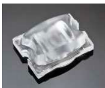
STRADA-DN 15.4 MM X 19.6 MM PMMA

OSRAM PLATINUM/DRAGON+ C11132_STRADA-DW CA11180_STRADA-DW