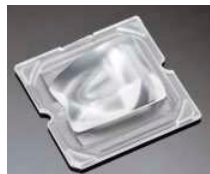
STRADA-SQ-T-DN 25 MM X 25 MM PMMA

PHILIPS LUMILEDS LUXEON M C12410_STRADA-SQ-A-T CA12411_STRADA-SQ-A-T