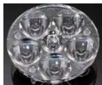
EMY D= 50 MM (6UP) PMMA

SHARP DOUBLE DOME C11814_SANDRA-12-M C11700_SANDRA-12-W