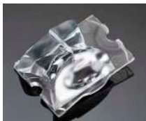
STRADA-FW 15.5 MM X 19.6 MM PMMA

CREE MX6 / MX3 C12329_STRADA-T-DN CA12332_STRADA-T-DN