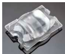
STRADA-B/B2 15.4 MM X 19.6 MM PMMA

CREE MX6 / MX3 C11244_STRADA-DN CA11245_STRADA-DN