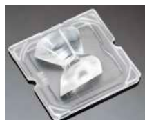
STRADA-SQ-T-DW 25 MM X 25 MM PMMA

SHARP DOUBLE DOME C11816_STRADA-SQ-T-DN CA11817_STRADA-SQ-T-DN