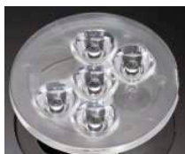
ANNA-5 D= 50 MM (5UP) PMMA

SHARP DOUBLE DOME C11799_ANNA-50-4-S C11800_ANNA-50-4-M C11801_ANNA-50-4-W