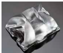
STRADA-A 15.4 MM X 19.6 MM PMMA

CREE XP-E / XP-G C10818_STRADA-A CA10823_STRADA-A