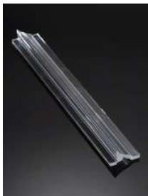
SOPHIE 150 X 20 MM PMMA

NICHIA NCS19 D12114_STRADA-S-14 DA12115_STRADA-S-14