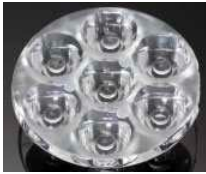
ANNA-7 D= 40 MM (7UP) PMMA

CREE XP-E / XP-G C11716_ANNA-40-7-S C11717_ANNA-40-7-M C11718_ANNA-40-7-W