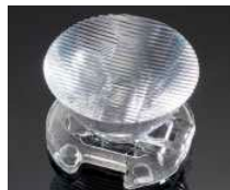
EMILY D= 26 MM PMMA

CA11387_EMILY-SS CA11388_EMILY-M CA11391_EMILY-M2 CA11389_EMILY-O CA11390_EMILY-O-90 CA11934_EMILY-W