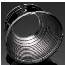
LENINA D= 74 MM METALLIZED PC