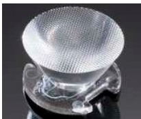
EMILY D= 26 MM PMMA

CA11663_HEIDI-RS CA12242_HEIDI-SS CA11264_HEIDI-D CA11265_HEIDI-M CA11266_HEIDI-O CA11267_HEIDI-O-90 CA11268_HEIDI-W CA12079_HEIDI-W2