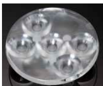
ANNA-5 D= 40 MM (5UP) PMMA

SEOUL Z5 C10921_GT4-S C10922_GT4-M C10923_GT4-W C10975_GT4-WW