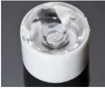
LISA D= 10.8 - 11 MM PMMA

CREE XP-E / XP-G CP11627_LISA-RS CP10641_LISA-SS