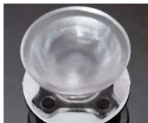
HEIDI D= 21.6 MM PMMA