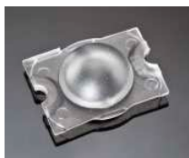
STRADA-C/C2 15.5 MM X 19.6MM PMMA

CREE XP-E / XP-G C11252_STRADA-C2 CA11253_STRADA-C2