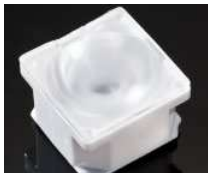
LAURA 21.6 MM X 21.6 MM PMMA

NICHIA NCS19 / NVS19 CA11974_LAURA-RS CA11977_LAURA-SS CA11975_LAURA-D CA11976_LAURA-M CA11978_LAURA-O CA11427_LAURA-REF-W CA12570_LAURA-W CA11978_LAURA-WW