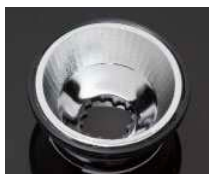
MINNIE (with holder) D= 35 MM METALLIZED PC

PHILIPS LUMILEDS LUXEON M C11862_MINNIE-W C12095_MINNIE-M C12097_MINNIE-WWWW