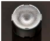
TINA2 D= 16.1 MM PMMA

CREE XP-E / XP-G CA11016_TINA2-RS CA11420_TINA2-D CA11017_TINA2-M CA11052_TINA2-O CA12056_TINA2-W