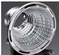
LENINA D= 111 MM METALLIZED PC

CN12656_LENINA-S CN12657_LENINA-M CN12658_LENINA-W CN12659_LENINA-S-DL CN12660_LENINA-M-DL CN12661_LENINA-W-DL