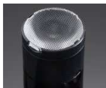
LEILA D= 21.6 MM PMMA

CA12124_NIS83-MX-2-RS CA12123_NIS83-MX-2-SS CA12122_NIS83-MX-2-D CA12126_NIS83-MX-2-M