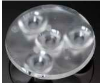
ANNA-4 D= 40 MM (4UP) PMMA

SHARP DOUBLE DOME C11710_ANNA-40-3-S C11711_ANNA-40-3-M C11712_ANNA-40-3-W