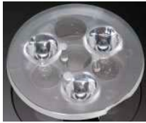
ANNA-3 D= 50 MM (3UP) PMMA

SHARP DOUBLE DOME C11716_ANNA-40-7-S C11717_ANNA-40-7-M C11718_ANNA-40-7-W