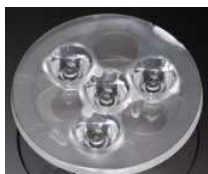
ANNA-4 D= 50 MM (4UP) PMMA

CREE XP-E / XP-G C11799_ANNA-50-4-S C11800_ANNA-50-4-M C11801_ANNA-50-4-W