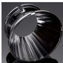
LENINA D= 74 MM METALLIZED PC

PHILIPS LUMILEDS LUXEON M C12480_MIRELLA-50-S-PIN C12481_MIRELLA-50-M-PIN C12482_MIRELLA-50-W-PIN CN12486_MIRELLA-50-S-PIN-DL CN12487_MIRELLA-50-M-PIN-DL CN12488_MIRELLA-50-W-PIN-DL