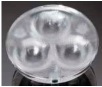
CUTE-3 D= 35 MM (3UP) PMMA

SHARP DOUBLE DOME C11916_SATU-S C11917_SATU-O C11602_SATU-M C11544_SATU-W