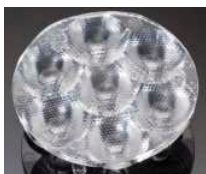
TAMPA D= 38 MM (7UP) PMMA

SHARP DOUBLE DOME C11670_ANNA-7-S C11679_ANNA-7-M C11682_ANNA-7-W