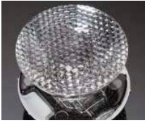
SPUTNIK D= 26 MM PMMA