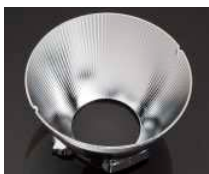
BRITNEY D= 70 MM METALLIZED PC

NICHIA COB C11552_BARBARA-S C11553_BARBARA-W C12461_BARBARA-WW