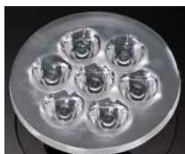
ANNA-7 D= 50 MM (3UP) PMMA

CREE XP-E / XP-G C11670_ANNA-7-S C11679_ANNA-7-M C11682_ANNA-7-W