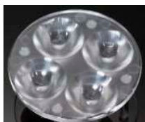
QUAK D= 50 MM (4UP) PMMA