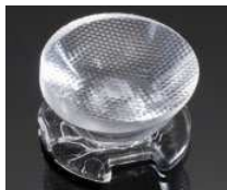
EMILY-WAS D= 26 MM PMMA

CREE XP-E / XP-G CA11998_EMILY-SS-WAS CA12000_EMILY-O-WAS