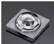
SIRI-A 13.9 MM X 13.9 MM PMMA