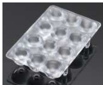
PETUNIA D= 29.5MM X 46.5MM PMMA