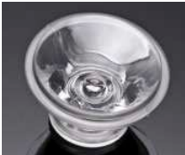
IRINA D= 24.7 MM PMMA