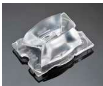
STRADA-DW 15.4 MM X 19.6 MM PMMA

OSRAM PLATINUM / DRAGON+ C10915_STRADA-C CA10916_STRADA-C