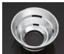
BROOKE (MOLEX) D= 45 MM METALLIZED PC

SHARP MEGAZENIGATA C12083_BROOKE-SCR-M C12084_BROOKE-SCR-W