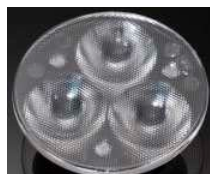
MARTHA / DOLLY D= 50 MM (3UP) PMMA

NICHIA 6Nx83 / 3Nx83 C11281_NIS83-MX-5-D C10472_RER-5-M C10814_NIS83-MX-5-W