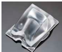
STRADA-T-DN 15.5 MM X 19.6 MM PMMA

CREE XP-E / XP-G C11415_STRADA-T-DN CA11416_STRADA-T-DN