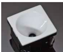
LAURA REFLECTOR 21.6 MM X 21.6 MM PMMA

CREE MC-E CA10716_BOOM-S CA10928_BOOM-M CA10929_BOOM-W