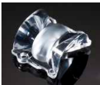
FLARE-B 29.0 MM X 24.5 MM X 14.5 MM PMMA

CREE MC-E / MC-E RGB CP10961_RGBX-SS CP10944_RGBX-M CP10945_RGBX-O