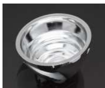
VENLA D= 45 MM METALLIZED PC

PHILIPS LUMILEDS LUXEON S C11773_VENLA-S C11775_VENLA-M C11776_VENLA-W C11777_VENLA-WW