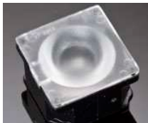
LAURA 21.6 MM X 21.6 MM PMMA

CREE XP-E / XP-G CA11353_LAURA-RS CA11643_LAURA-SS CA11360_LAURA-D CA11355_LAURA-M CA11365_LAURA-O CA11525_LAURA-REF-W CA12343_LAURA-W CA11766_LAURA-WW