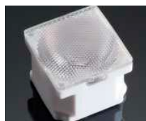
ROSE 21.6 MM X 21.6 MM PMMA