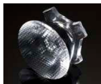
HEIDI D= 21.6 MM PMMA

NICHIA 6Nx83 / 3Nx83 FA10734_TWIDDLE-D FA10736_TWIDDLE-M