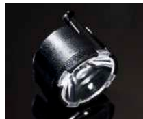
LISA2-CLIP D=9.9 MM PMMA

LUXEON REBEL FP11086_LISA2-RS-CLIP FP11072_LISA2-M-CLIP FP11122_LISA2-O-CLIP FP11858_LISA2-O-90-CLIP FP11073_LISA2-W-CLIP FP11074_LISA2-WW-CLIP FP11952_LISA2-WWW-CLIP