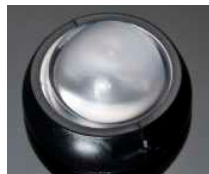
TWIDDLE D= 21.6 MM PMMA

AVAGO JADE CA12346_TINA2-RS CA12347_TINA2-D CA12348_TINA2-M CA12349_TINA2-O CA12350_TINA2-W CA12403_TINA2-WW