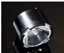
LISA2-PIN D= 9.9 MM PMMA

FP11057_LISA2-RS-PIN FP10998_LISA2-M-PIN FP11127_LISA2-O-PIN FP11855_LISA2-O-90-PIN FP10999_LISA2-W-PIN FP11000_LISA2-WW-PIN FP11954_LISA2-WWW-PIN