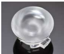
TINA-O-PLUS D= 16 MM PMMA

CREE XM-L FA11905_TINA-3-S FA11902_TINA-3-W FA11903_TINA-3-WW FA11904_TINA-3-WWW