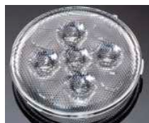
PENTA D= 35 MM (5UP) PMMA

CREE MX6 / MX3 C10436_NIS83-MX-3-M C10364_NIS83-MX-3-W