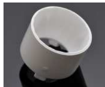
LISA2 REFLECTOR D= 9.9 MM PC