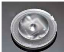
JULIA-A 18.9 MM X 4.7 MM PMMA

CREE XP-E / XP-G & SEOUL Z5 F11947_JULIA-A FA11948_JULIA-A