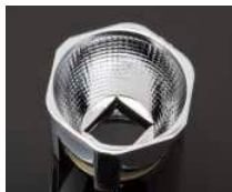
BOOM D= 22.2 MM METALLIZED PC

CREE MC-E CA10716_BOOM-S CA10928_BOOM-M CA10929_BOOM-W