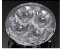
CUTE-4 D= 35 MM (4UP) PMMA

SHARP DOUBLE DOME C11793_ANNA-40-4-S C11794_ANNA-40-4-M C11795_ANNA-40-4-W