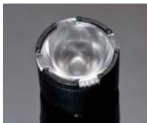
LISA2-PIN D= 9.9 MM PMMA