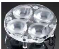
ANGIE D= 34 MM (4UP) PMMA

CREE XP-E / XP-G C12285_ANGIE-S C12286_ANGIE-M C12287_ANGIE-M2 C12288_ANGIE-W