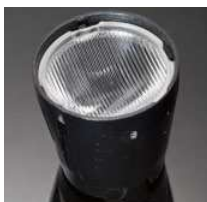
EYA D= 30 MM PMMA

FCN11257_LO1-RS FCN11259_LO1-D FCN11260_LO1-O FCN11258_LO1-M FCN11466_LO1-M2 FCN11262_LO1-REC FCN11261_LO1-W