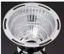
LENA D= 111 MM METALLIZED PC

CN12715_LENINA-S CN12716_LENINA-M CN12717_LENINA-W CN12721_LENINA-S-DL CN12722_LENINA-M-DL CN12723_LENINA-W-DL