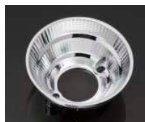
BROOKE-SCR D= 45 MM METALLIZED PC

BRIDGELUX ES-SERIES CA11181_BROOKE-S CA11182_BROOKE-M CA11183_BROOKE-W