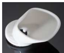
RITA D= 36 X 29 MM PC

SHARP MINI ZENIGATA C10982_CINDY-S C10983_CINDY-M C10984_CINDY-W