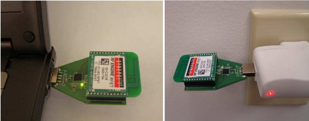
Figure 4 – A SNAPstick drawing power from a laptop PC and USB AC Adapter

The module does not require Synapse's Portal software or other software drivers to be installed in order to draw power from the PC's USB port.