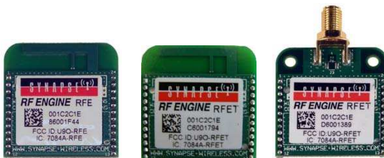
Figure 2 - The Synapse RFE, RFET, and RFET with external antenna engines