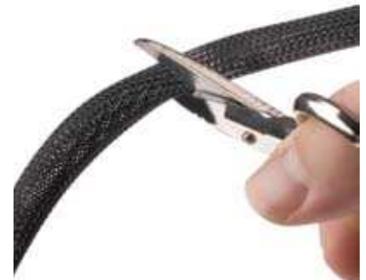
Clean Cut cuts easily and neatly with regular scissors and maintains a fray resistant end during installation.