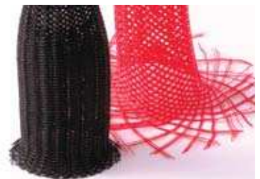
When scissor cut, the end of Clean Cut will withstand heavier handling without fraying than standard PT.