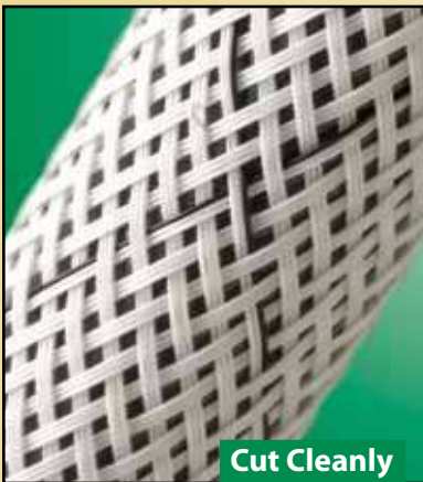
Cut Cleanly Hot Knife