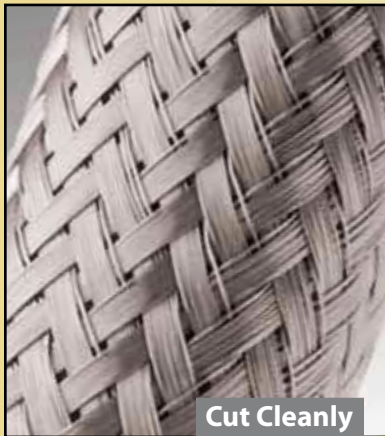
Cut Cleanly Shears