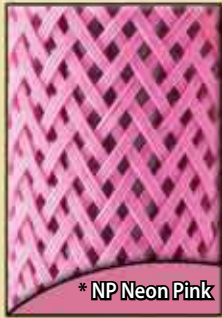
*NP Neon Pink