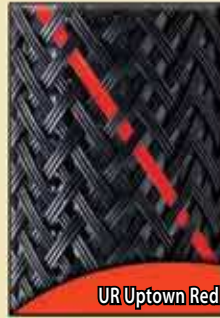
UR Uptown Red