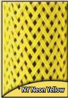
*NY Neon Yellow