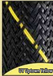
UY Uptown Yellow