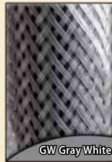
GW Gray White