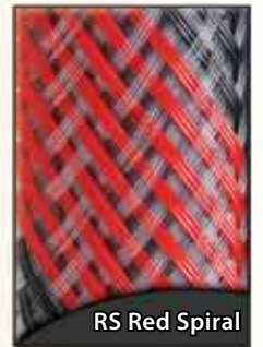
RS Red Spiral