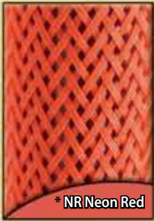
*NR Neon Red