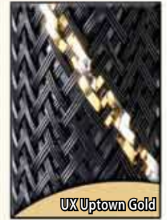
UX Uptown Gold