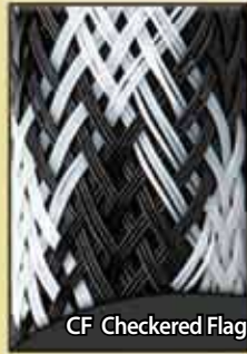
CF Checkered Flag