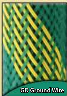
GD Ground Wire