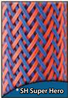
*SH Super Hero