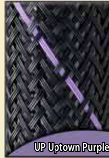
UP Uptown Purple