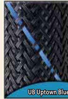
UB Uptown Blue