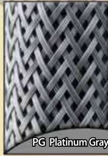
PG Platinum Gray