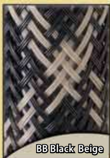
BB Black Beige

Clear with Red and Green Spiral and Gold Strip