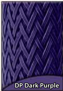
DP Dark Purple