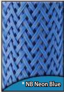
*NB Neon Blue