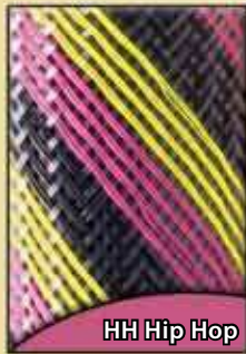
HH Hip Hop

Clear with Black, Neon Yellow and Neon Red Spiral