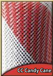
CC Candy Cane