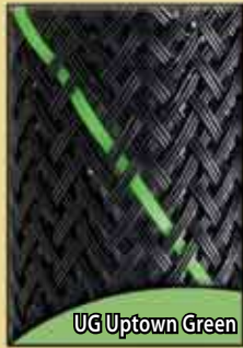
UG Uptown Green