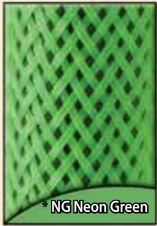
*NG Neon Green