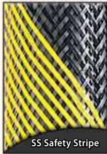
SS Safety Stripe