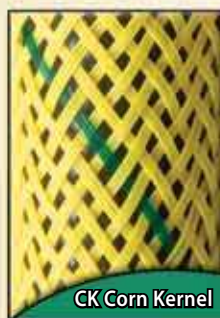
CK Corn Kernel