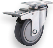
Polyurethane Medium Duty