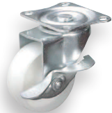
Nylon Medium Duty