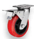
Polyurethane Heavy Duty