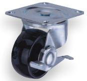
Plastic Low Profile