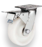
Nylon Heavy Duty