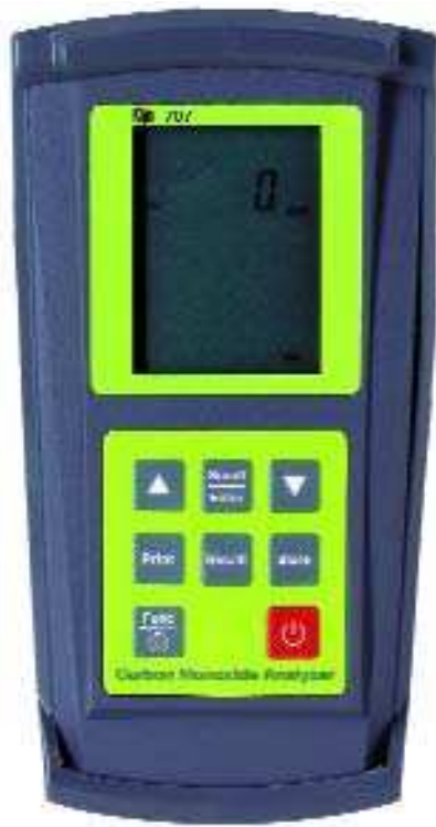
4.0"w X 8.12"h x 2.25"d

Test flue gasses at home or office spaces for the presence and location of CO leaks. With a protective rubber boot, the new 707 fits comfortably in your hand and operates with the push of a button.