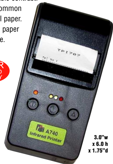
3.0"w x 6.0 h x 1.75"d