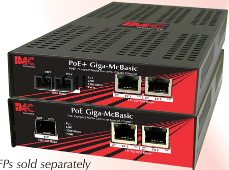
* SFPs sold separately

Utilizing Power over Ethernet Plus technology, the PoE+ Giga-McBasic functions as the power source (PSE). Both copper ports are capable of sending data and 25.5 Watts of power to the remote Wireless Access Point and the PTZ security camera.