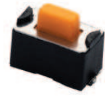
Gull Wing, 320g, Orange Actuator