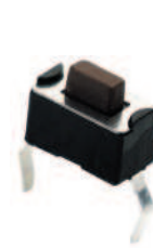
Thru-Hole, 160g, Brown Actuator

Used in applications such as consumer electronics, audio equipment, PCs, VCRs, cable boxes, modems, communications equipment, controls, security and alarm equipment, and test and measurement equipment.