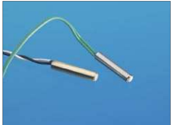
Moisture Resistant Thermistor Sensor

Any number of different thermistor curves and values can be accommodated as well as a broad range of housing and wire styles. Terminations can be provided utilizing various connector pins or lugs. Please contact the factory for specific design or application information or the availability of options.