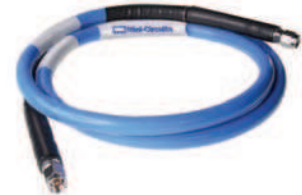
CASE STYLE: MA1628-1.5