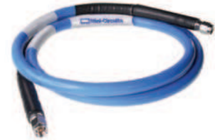
CASE STYLE: MA1628-3.28