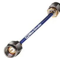
CASE STYLE: KP1505-9