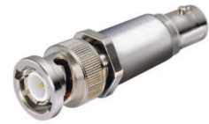
CASE STYLE: FF747