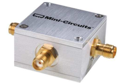
SMA version shown CASE STYLE: K18