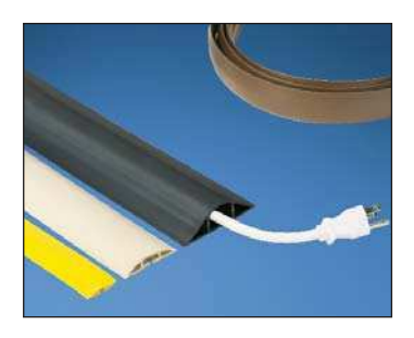
FG1 FG3 FG5