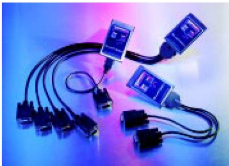
Quatech serial PCMCIA cards add one or two RS-232 or RS-422/485 ports to portable computers.

Quatech serial PCMCIA cards (PC Cards) provide a simple yet robust solution for adding multiple serial ports to laptops, notebooks, tablets, handhelds and embedded systems.