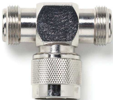
Model 73044 N Type "T" Jack-Plug-Jack Adapter