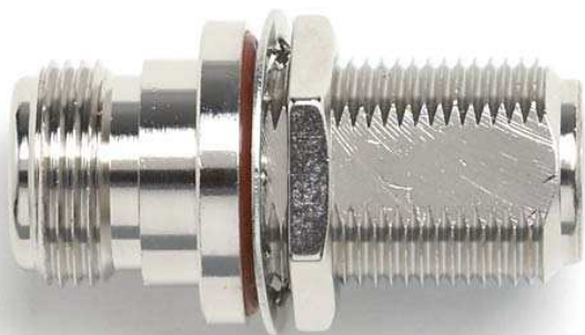
Model 73045 N Type Jack to Jack Bulkhead Adapter, Pressurized