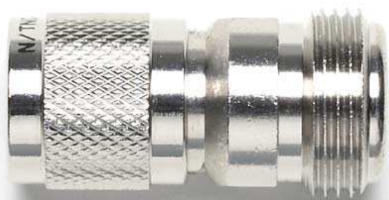
Model 73046 N Type Jack to TNC Plug Adapter