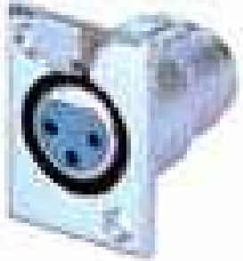
Model 5113A XLR (F) 3-pin rectangular flanged mount

Protect contacts and absorb vibrations in your audio applications