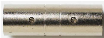
Model 6857 XLR (M/M) Adapter