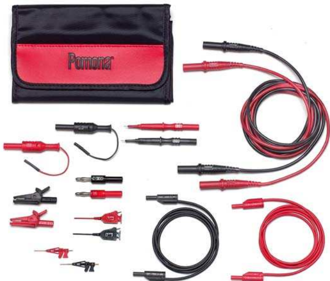
Model 72928 SMD Multi-Use Test Kit

Everything you need for SMD Test with your DMM in one kit