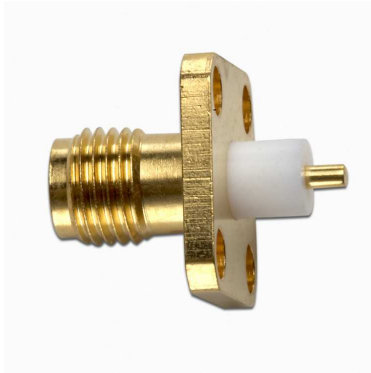
Model 72962 SMA JACK PANEL RECEPTACLE (4 HOLE)

High bandwidth, small size, and durability for confident connections