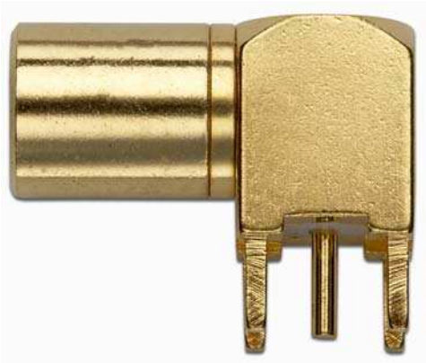
Model 72997 SMB PLUG R/A PCB RECEPTACLE