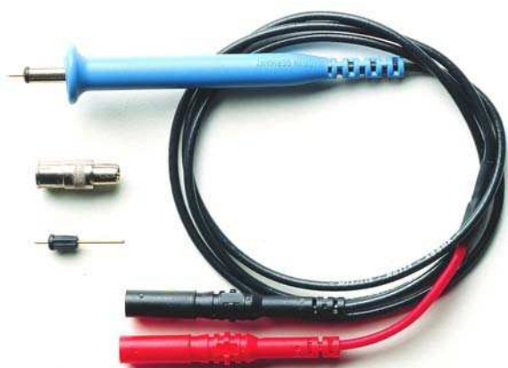
Model 6106 DMM RF Detector Test Probe